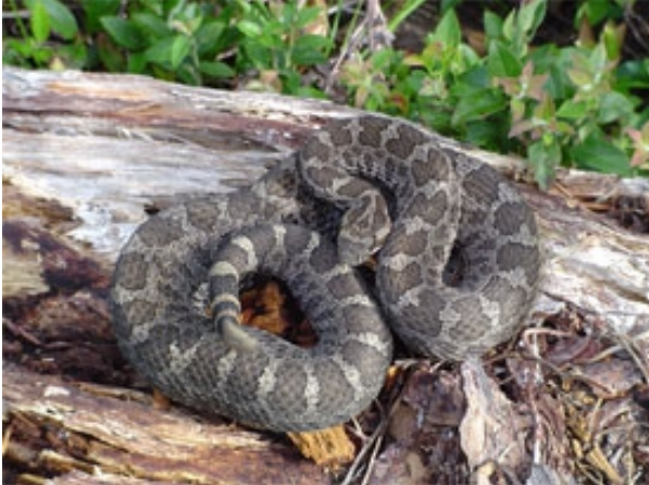
Eastern massasauga rattlesnake

The eastern massasauga is seldom seen. A timid, sluggish snake, about 2-3 feet in length, it is colored with a pattern of dark brown slightly rectangular patches set against a light gray-to-brown background. Occasionally, this coloration can be so dark as to appear almost black. The belly is mostly black.